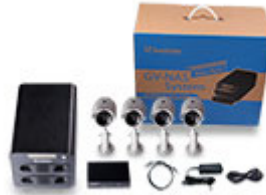
Bundled Package for GV-NAS2008