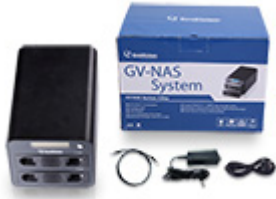
GV-NAS System Single Package

You can choose to purchase a GV-NAS System package or a bundled package which also includes 4 GV-Target IP Camera of your choice and a GV-PoE switch. For more details, please see the " Packing List " tab.